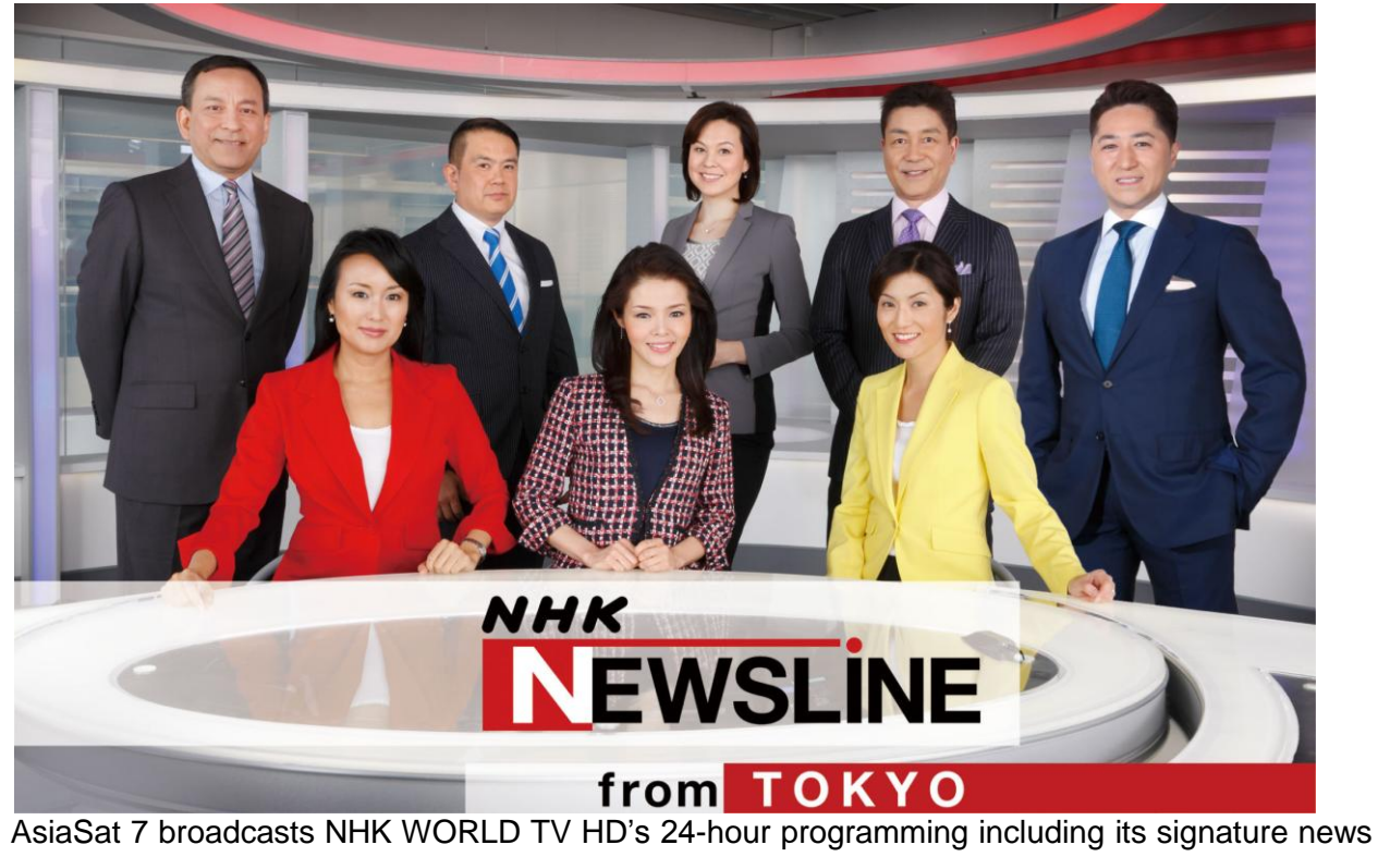
show "NHK NEWSLINE" in the Asia-Pacific