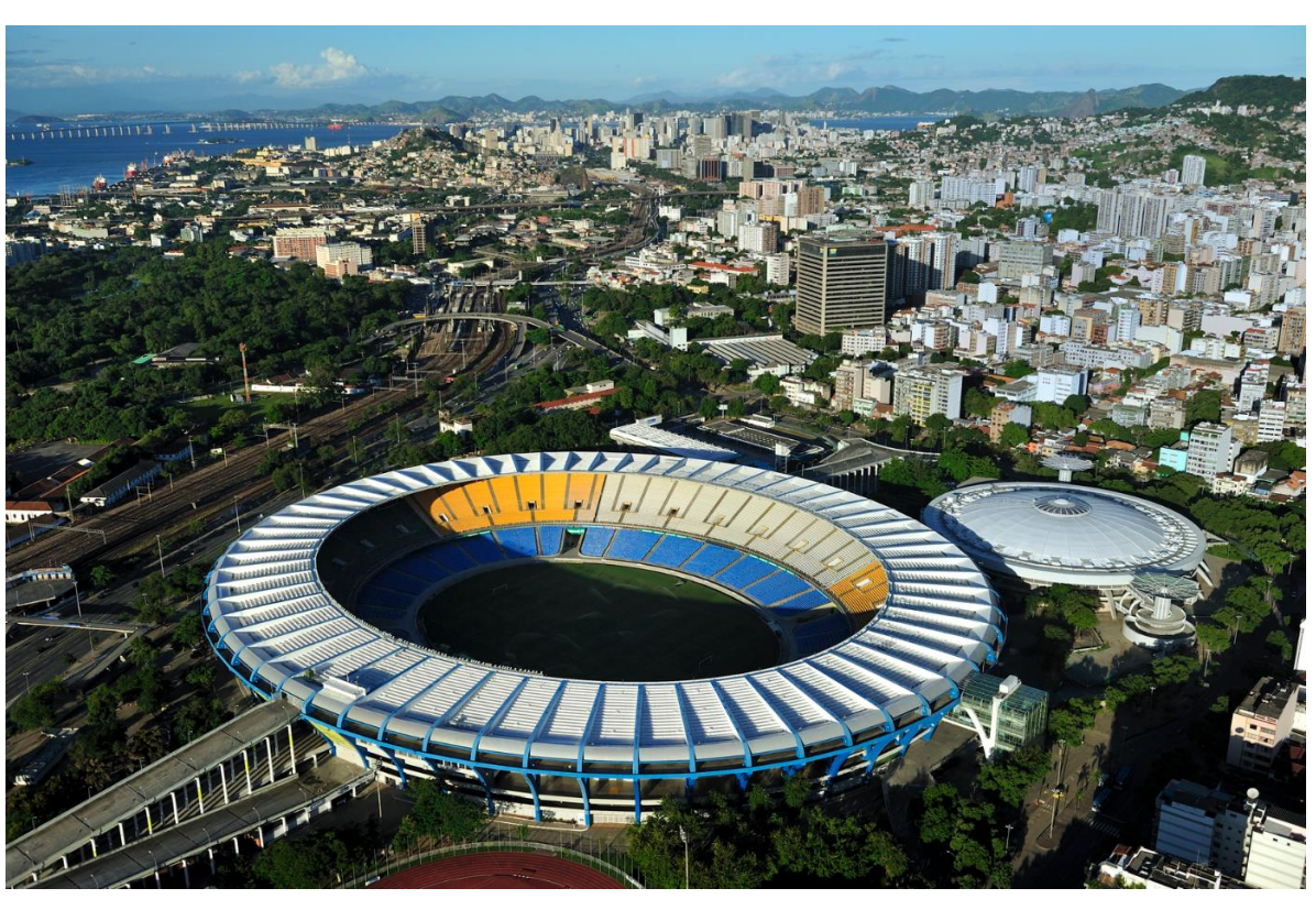
AsiaSat delivers live TV coverage of Rio 2016, including the opening and closing ceremonies at Maracanã Stadium, Rio de Janeiro, Brazil

Tel: (852) 2500 0880 Email: wpang@asiasat.com